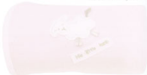
His GEM receiving blanket