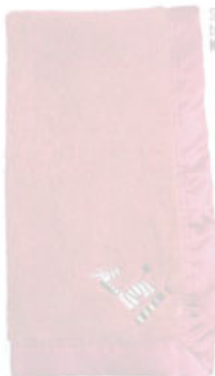
Satin-trim blanket by Kushies