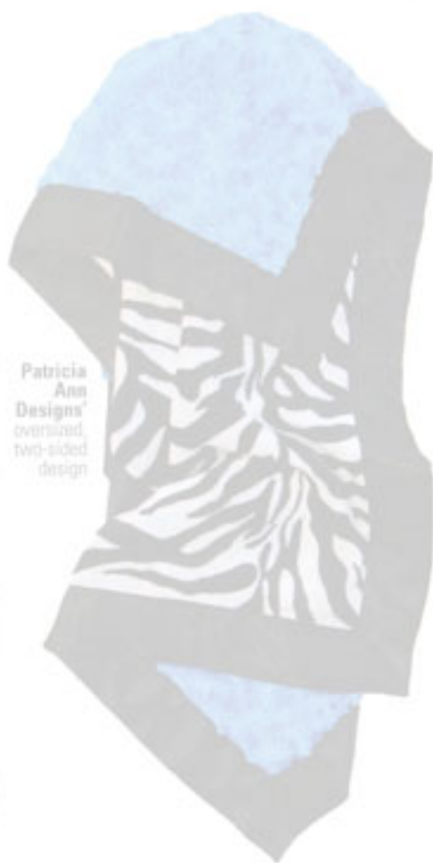
Patricia Ann Designs oversized two-sided design