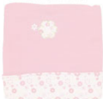
Kalencom polar fleece style