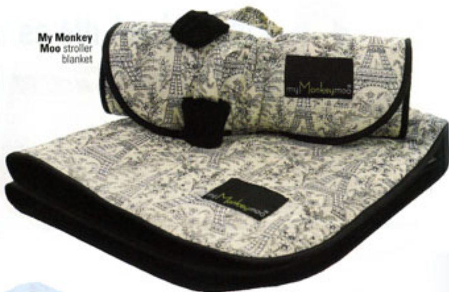
My Monkey Moo stroller blanket