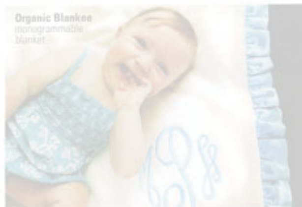
Organic Blankee monogrammable blanket