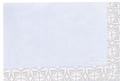
Baby Star poodle fabric blanket