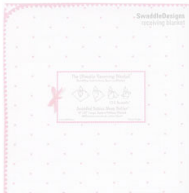
SwaddleDesigns receiving blanket